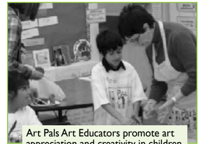
Art Pals Art Educators promote art appreciation and creativity in children

Starts curriculum and created a program to serve fourth-grade students. The new curriculum builds upon the lessons taught in the third-grade Art Pals program and was well-received by participating students and faculty at Reseda Elementary. During the upcoming school year, the Art Pals program will be offered to both third- and fourth-grade students at participating schools.