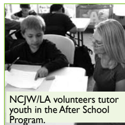
NCJW/LA volunteers tutor youth in the After School Program.