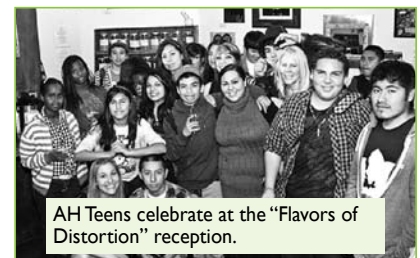
AH Teens celebrate at the "Flavors of Distortion" reception.