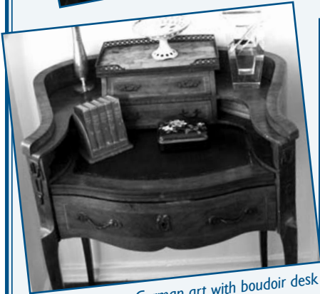
19th century German art with boudoir desk