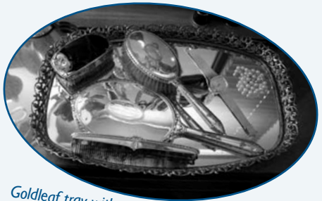
Goldleaf tray with women's beauty set and pearl necklace with 14k gold watch