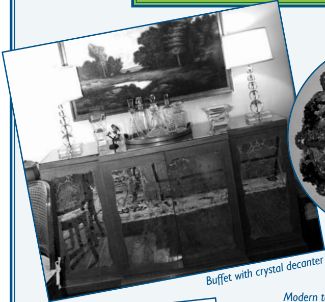
Buffet with crystal decanter