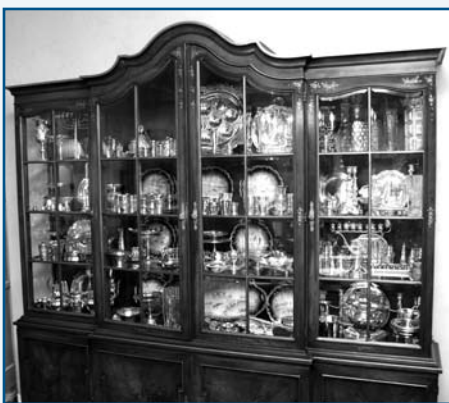
Grand buffet filled with sterling silver, porcelain, and crystal