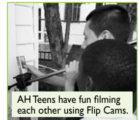
AH Teens have fun filming each other using Flip Cams.

This year, NCJW/LA and Alexandria House will be partnering with the Echo Park Film Center to guide the teens in creating their own film! While the theme of the film has not been determined at this time, the teens are eager to learn and engage in the process of writing, directing, and producing a film. Stay tuned for details regarding the premiere!