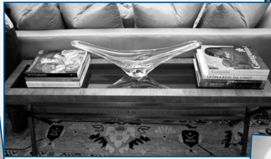
Modern table with glass Baccarat bowl