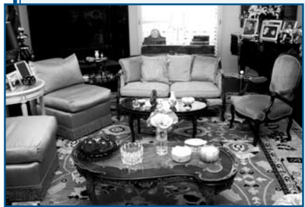
Living room by Thrift