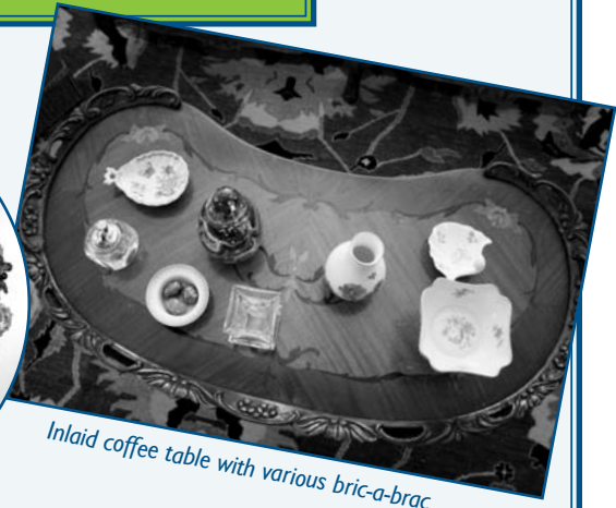
Inlaid coffee table with various bric-a-brac