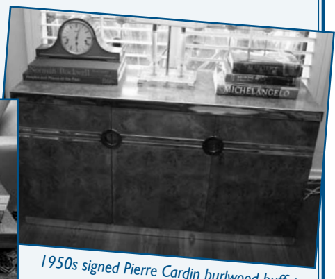
1950s signed Pierre Cardin burlwood buffet